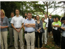
The beginning of the much-anticipated mangrove forest tour.