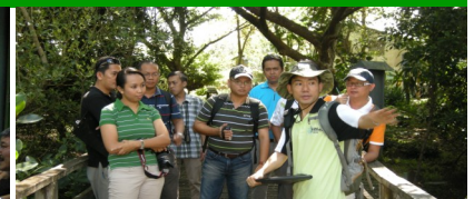
Government sectors employees during an induction session to the mangroves ecosystem.