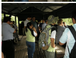
The ambassadors were pleasantly surprised by the appearance of several exotic bird species during the stop at the Bird Hide, the longest stop of the tour.