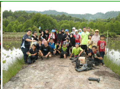
One for the record: An elated looking group rested after two hours' of intense labour—for the environment.