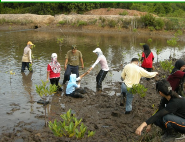
They keep rising each time they fall: The future educators demonstrate exemplary work ethics.

26-strong team from Teachers' Institute of Kent, Tuaran, braved an early morning date with KKWC staff to replant mangroves at Sulaman Forest Reserve, Tuaran. Fast rising tide was of concern thus the need to make an early start—before 8 a.m.! 600 saplings were planted successfully by these future educators who beamed with pride and contentment with their achievement. Replanting activities are moving in fluid pace that achievement is now ahead by 22.3% of the target! Volunteers are indeed the heartbeat of this replanting activity and they deserve all appreciations and credits for their unwavering support.