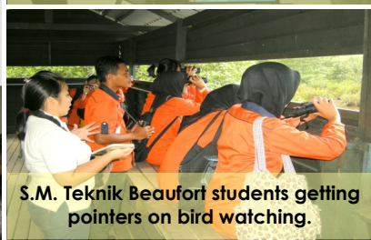
S.M. Teknik Beaufort students getting pointers on bird watching.