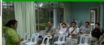
Korean Teachers during a recce visit to Kota Kinabalu dropped by at KKWC for mangroves education.