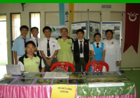
Instilling mangroves importance during World Earth Day 2011 on 27/4/2011 celebrated at S.M. All Saints.