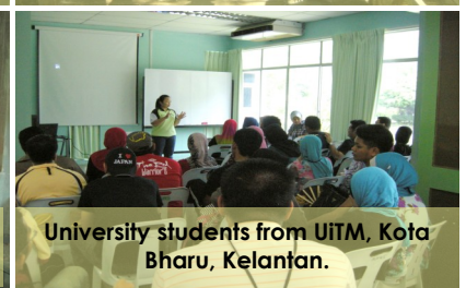
University students from UiTM, Kota Bharu, Kelantan.