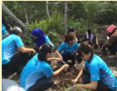
2. Nursery work