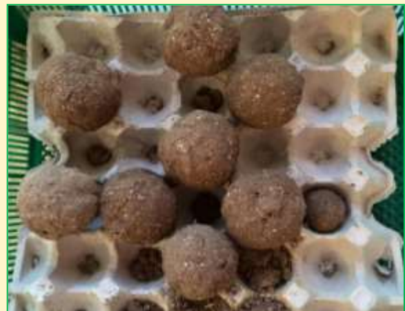
Our EM Mud Balls, ready to roll!