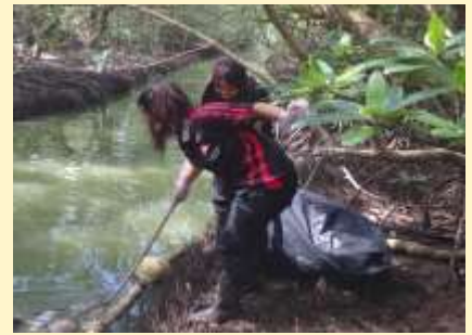
3. Mangrove cleanup

05th Sept 2015: 12 gorgeous ladies from Inner Wheel Club