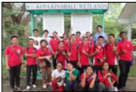
Group photo and presentation of certificate to the participants