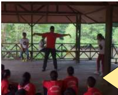
EE Games at the Outdoor Classroom