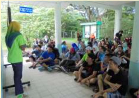
Welcoming and Safety Briefing

04th Sept 2015: 60 students of Pusat Teknologi dan Pengurusan Lanjutan (PTPL).