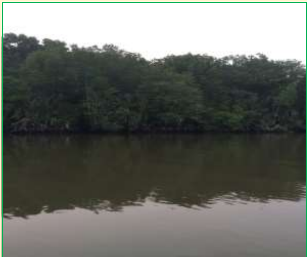
Various of flora and fauna can be found here