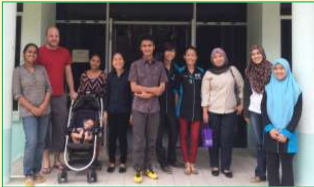
Group photo: Interns, UMS lecturers and Industrial Supervisor after the report presentation