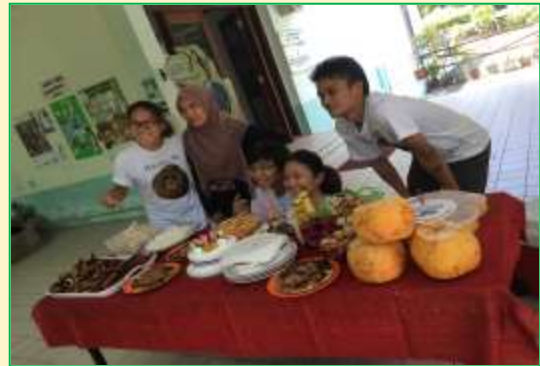
Farewell party for the Interns during their last day at work on 19th September 2015