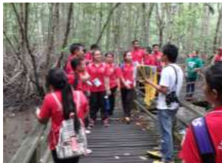
Guided interpretative walk into mangrove