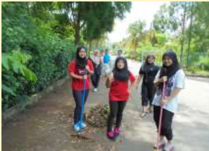
1. General cleaning