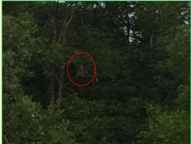
Spotted Proboscis Monkey resting on a tree