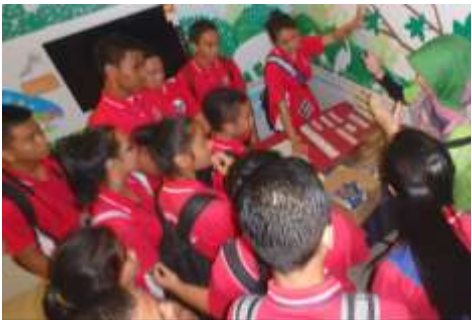
One of favourite location; the Exhibition Hall. The 'Oh Wow Moment' by the students.

14 science students accompanied by their biology teacher came to experience the mangrove forest to deepen their knowledge of the forest as it is included in their biology syllabus.