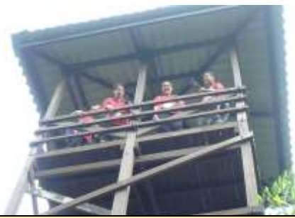
The 3-storey of Observatory Tower